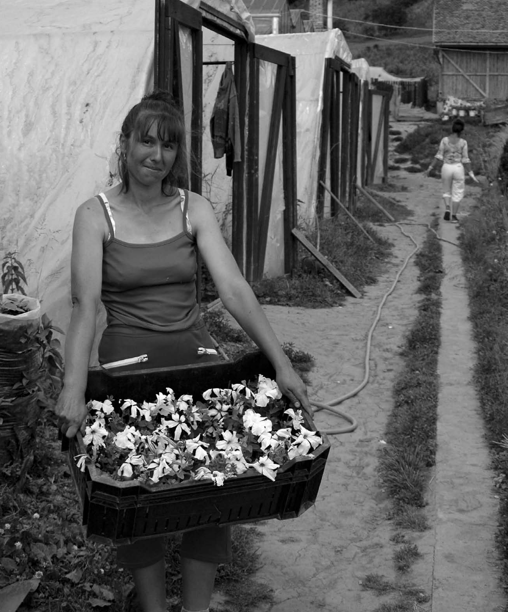
Client of OMRO in Romania.