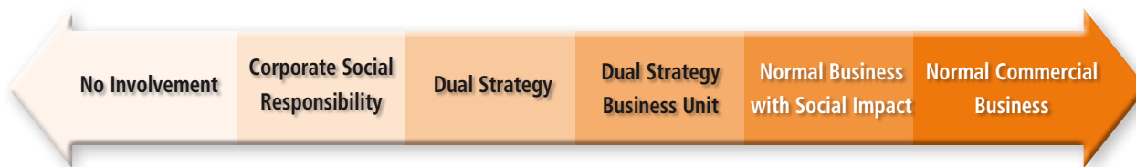
Figure 1: Level of Contribution towards microfinance

One remarkable phenomenon is the fact that increasing numbers of banks are starting to place their microfinance activities in normal business units. These units use a range of accompanying specialists and are beginning to see their microfinance activities as part of the bank’s total business services. Figure 1 and Table 2 distinguish between strategies of the banks’ microfinance activities. This classification represents the banks’ approach to microfinance.