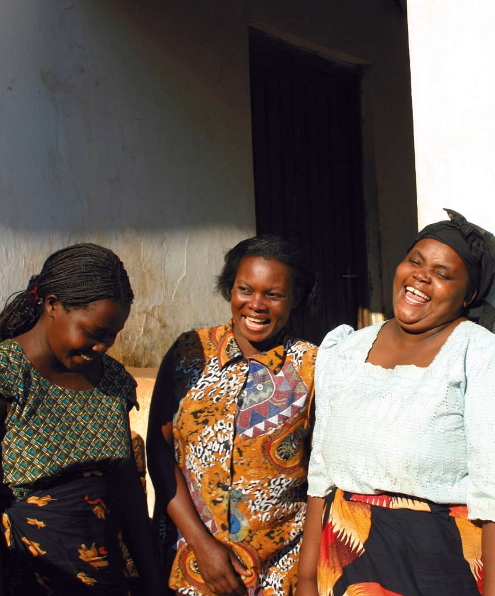
Clients of Opportunity International Bank in Malawi.