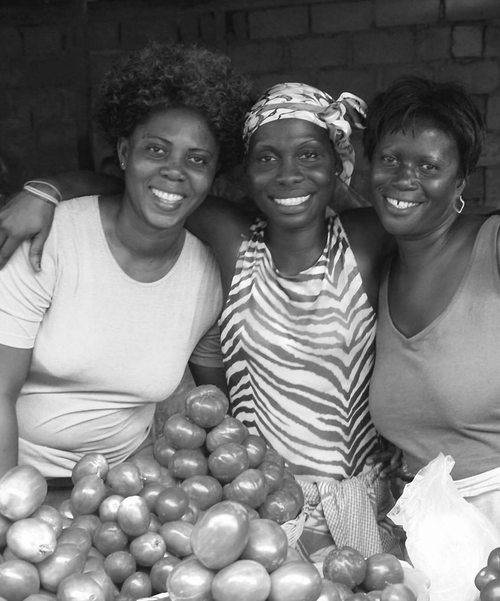
Clients of Opportunity International Bank in Ghana.