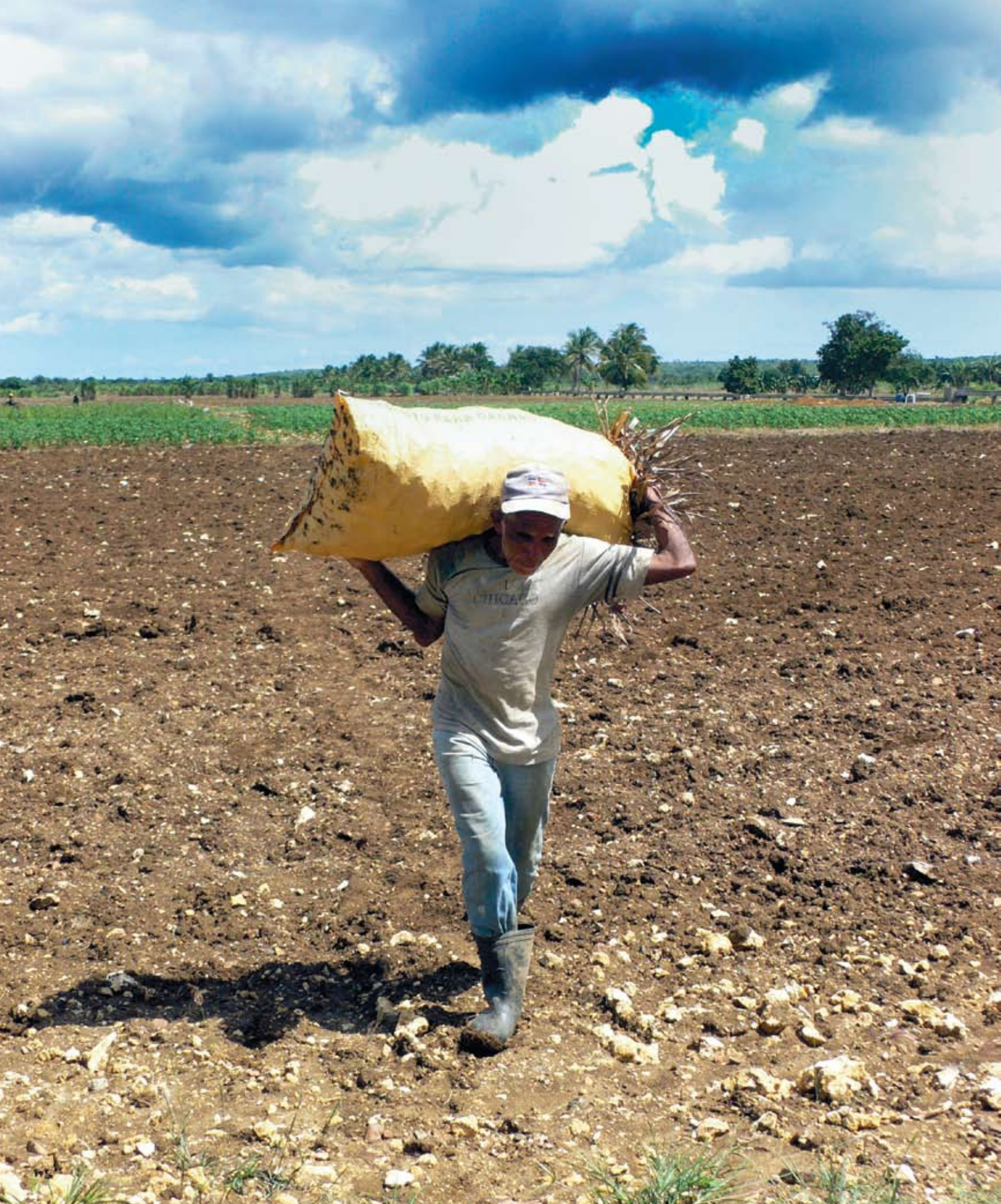
Agricultural labourer in Dominican Republic.