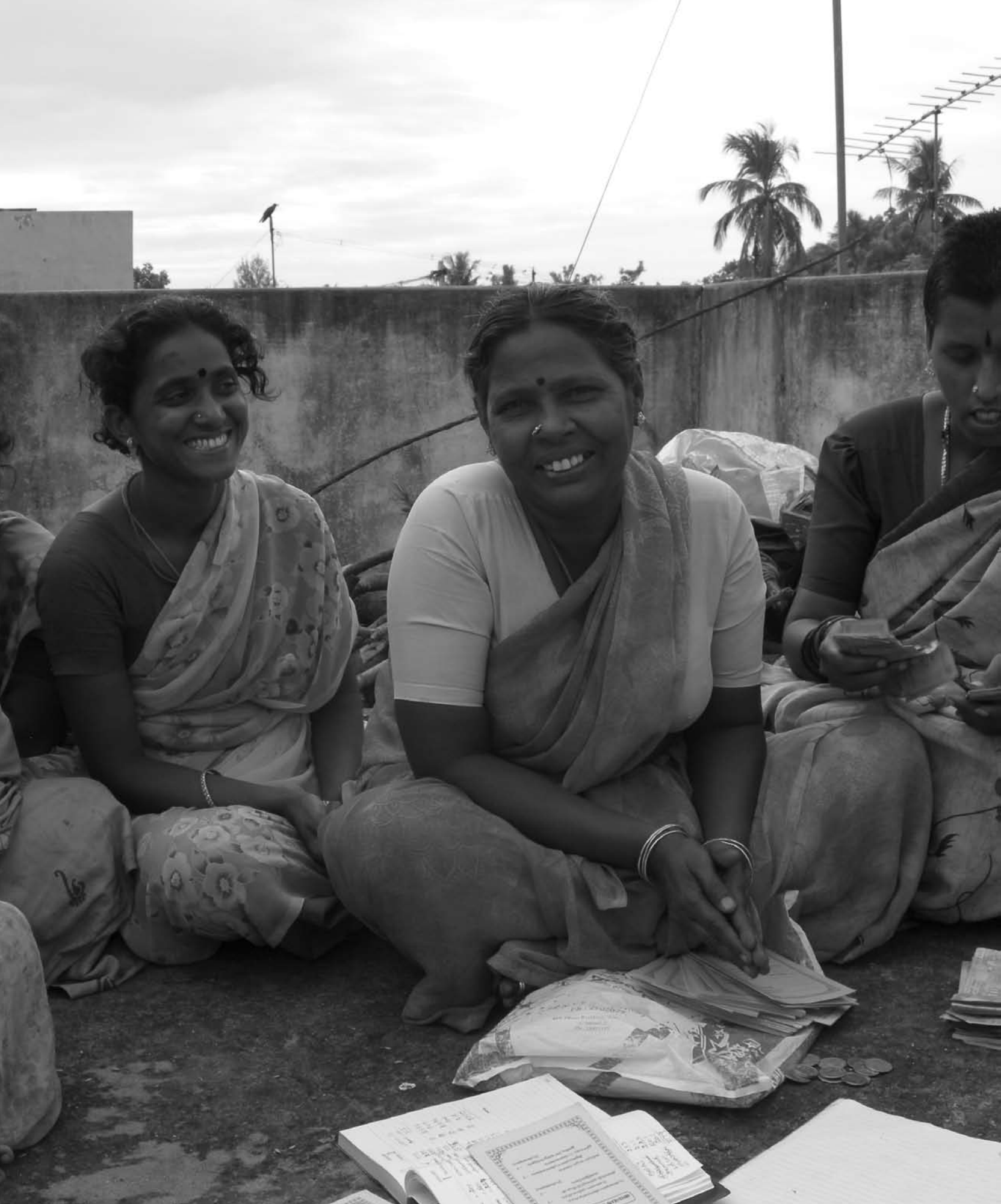
Group meeting of clients of the Samayapuram branch of ASA Grama Vidiyal, India.